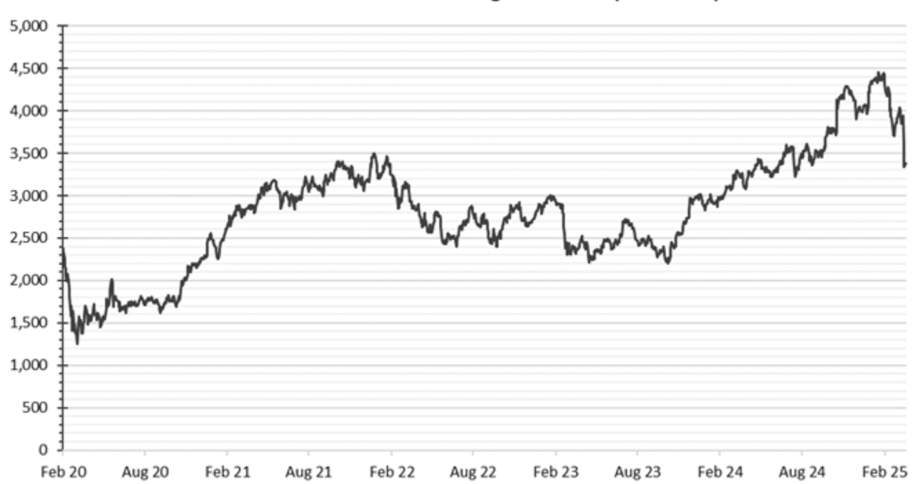
HISTORICAL RESULTS ARE NOT INDICATIVE OF FUTURE RESULTS.